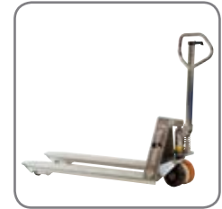
The pallet truck is also available in an explosion proof version.