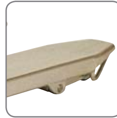
Closed forks mean easy cleaning and few hiding places for bacteria.