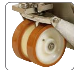
Wheels with rubber-sealed bearings.

Please ask for specification details or visit our website www.logitrans.com We also offer tailor-made solutions.