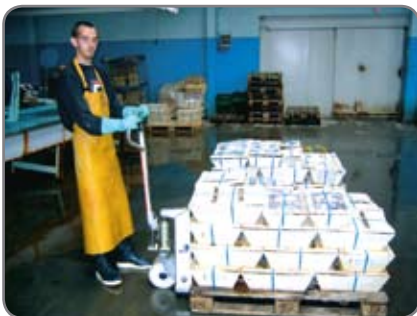
RF-SEMI - for the food industry in areas, where hygiene demands are not so high, but corrosion resistance important.