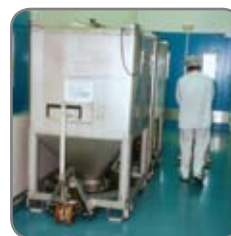
RF-PLUS pallet truck being used in the pharmaceutical industry.