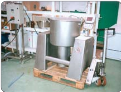
RF-PLUS - for the food industry and the pharmaceutical industry with strict hygiene and sanitation requirements.