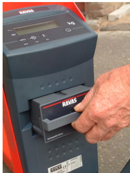
Exchangeable battery module