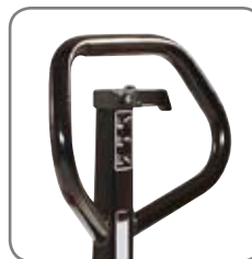
Ergonomic handle ensures the user a relaxed hold.