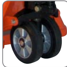
The special rubber wheels are gentle to floor and flagstone layer and do also have eminent anti-static qualities.