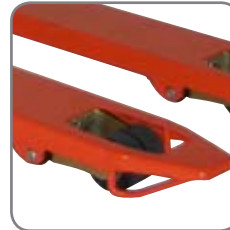
The hoop skates on the forks ensure an easy fork insertion and withdrawal in/out of pallets.