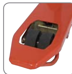
With twin fork wheels it is very easy to change direction.