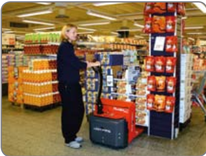
Panther Mini (capacity 1400 kg) is recommended for easy pallet transport, e.g. in super markets and in stock areas.