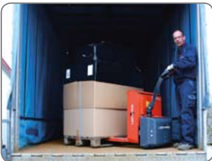
Panther Maxi (capacity 1800 kg) is recommended for heavy pallet transport, e.g. in the transport industry.