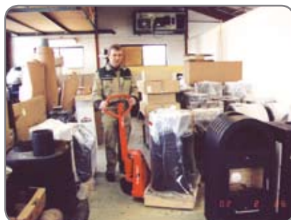
An easy handling of goods is ensured even in very confined spaces.