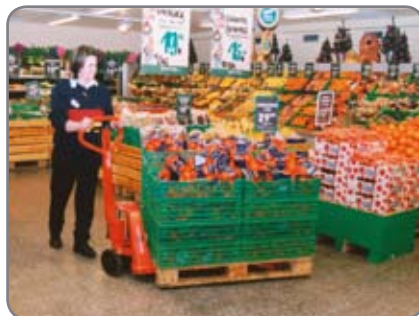
Adjustable fork height - no problems when handling low and worn pallets.