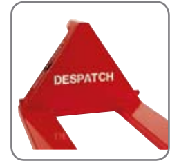
The company name or logo can be cut out in the triangle of the Panther.