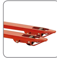
The hoop skates on the forks ensure an easy fork insertion and withdrawal in/out of pallets.