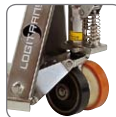
Different wheel types, to suit the needs of the user.