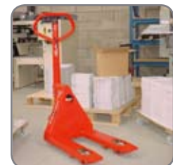
Panther is available with different fork lengths.