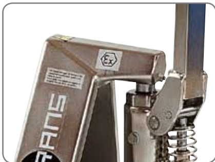
The explosion proof trucks are suitable for the pharmaceutical, chemical, oil, gas and paint industry.