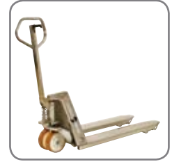
Strong construction ensures a long operating life and low maintenance costs.