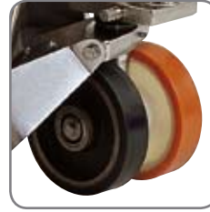
The trucks have at least one vulkollan anti-static wheel in order to conduct away static electricity.