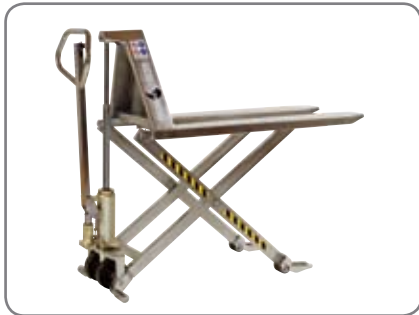
The standard trucks are manual and made of stainless steel.