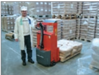
Optimum safety through transparent and impact-resistant safety screen and reduced driving speed in raised position.