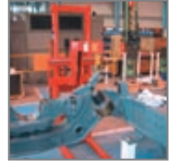
Available with side-tilting forks and/or optional extras, e.g. crane arm, drum turner, remote control, level control, built-in charger.