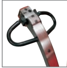
Possible to operate with the handle upright. Central location of all control buttons.

Strong construction ensures a long operating life and low maintenance costs.