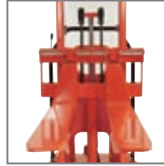
Adjustable forks are available as optional extra in many different lengths and types.