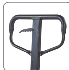
Rubber covered handle ensures a comfortable hold.