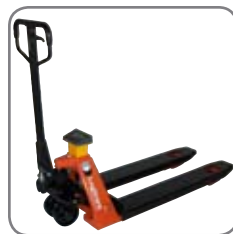
Accurate weighing results with four built-in weighing cells.