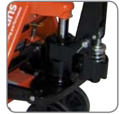
Reliable leak-proof hydraulic system.