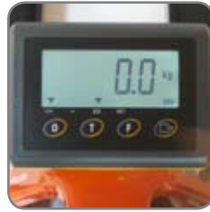
The BFC6 has tare and zero setting, and can show kg or lb.