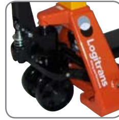
The turning angle of BFC6 is 210°, ensuring easy operations in confined areas.