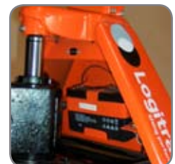
Built-in charger with an easily accessible charger plug.

Please ask for further information or visit our website www.logitrans.com